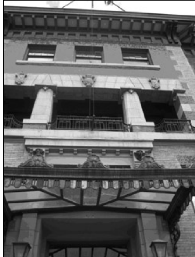
Silver Bow Club, Butte, August 24, 2005.

with wrought iron railings was accented by two canted columns topped by stylized pegged capitals and, at each corner, quoins of alternating light and dark masonry that lightened mass without compromising density. The balcony’s sandstone cornice with raised chevron elements featured three cartouches, the center with an entwined “SBC” and the flanking ones depicting a bow and club, a visual pun on the club’s name and Butte’s resident county. The top story’s fenestration and