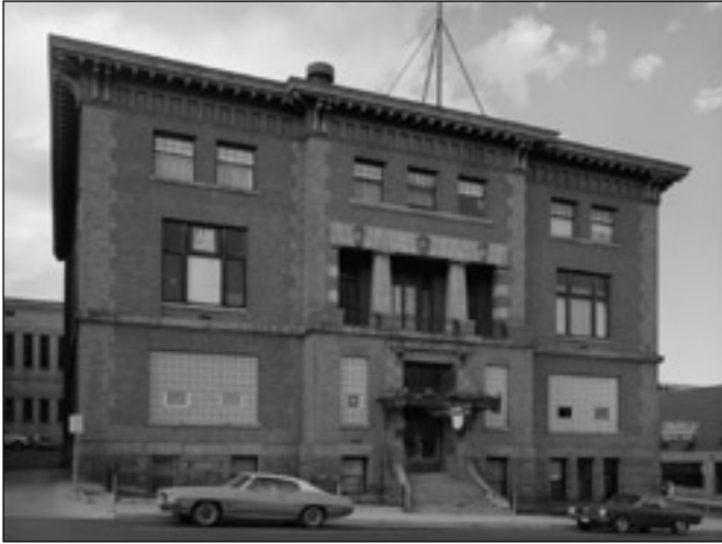
“The Miners Union Local #1 was built at 125 West Granite in 1906 to house the Silver Bow Club, an exclusive Butte businessmen’s club,” ca. 1980. Historic American Buildings Survey/Historic American Engineering Record (HAER MONT,47-BUT,1-70). Photograph by Jet Lowe.

with wrought iron railings was accented by two canted columns topped by stylized pegged capitals and, at each corner, quoins of alternating light and dark masonry that lightened mass without compromising density. The balcony’s sandstone cornice with raised chevron elements featured three cartouches, the center with an entwined “SBC” and the flanking ones depicting a bow and club, a visual pun on the club’s name and Butte’s resident county. The top story’s fenestration and