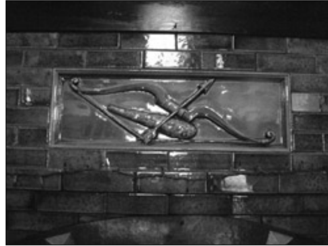
Silver Bow Club reception hall fireplace detail, Butte, February 22, 2006.

woodwork is green, showing the grain of the wood and is inlaid with broad red lines [of wood]. A wainscoting 7 ½ feet high extends around the [12-foot high] room. Above the wainscoting is a splendid hand-painted frieze, depicting mountain and pastoral scenery.” Above the wainscoting, a plate rail ran all the way around the room with china closets enclosing two columns, likely steel posts, at the center of the room. Hanging light fixtures made of substantial Craftsman-style statuary bronze (a durable satin finish) and spherical glass shades reinforced the masculine aspect of both rooms.