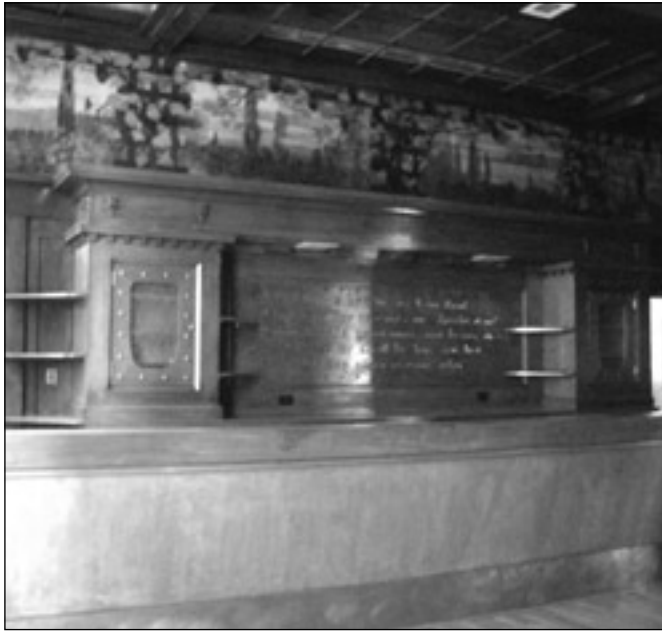
Above: Silver Bow Club bar room, Butte, February 22, 2006.