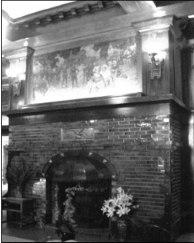
Silver Bow Club reception hall, Butte, February 22, 2006.