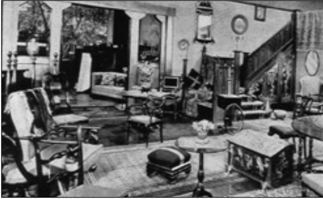
Advertisement for William A. French & Company, St. Paul showroom. The Western Architect, August 1905.