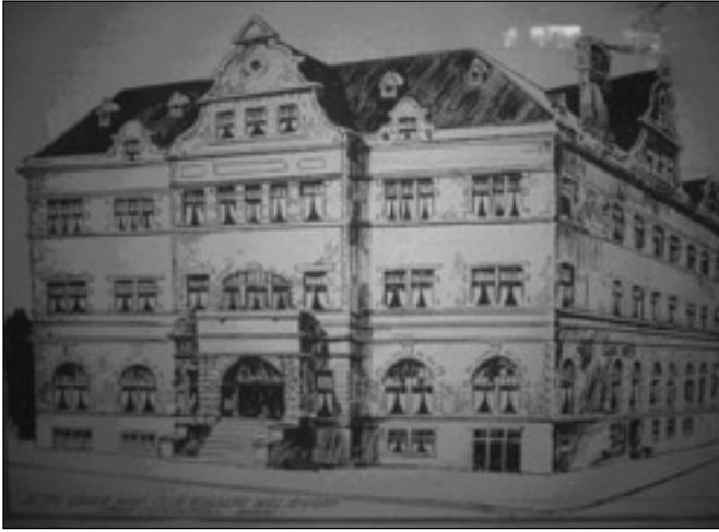
"New Home of the Silver Bow Club." Anaconda Standard, May 22, 1906.