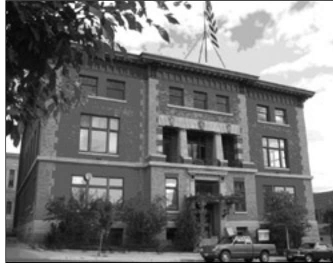
Silver Bow Club, Butte, August 24, 2005.

The completion of the Silver Bow Club manifested the city's ambitious expectations: "Any city," bragged the Miner , "that can boast of a club building such as is being erected . . . can well claim rank with the foremost in the country. . . . it [will be] worthy of classification with any metropolitan club." Founded by