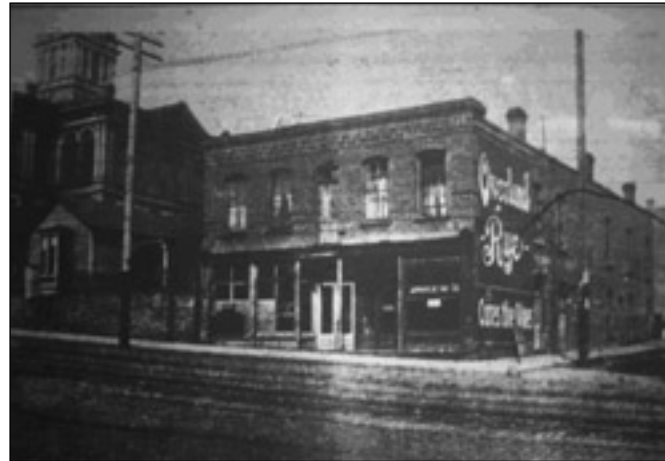
“Site of Silver Bow Club Building.” Anaconda Standard , April 22, 1906.

The Cutter-Malmgren design was not carried out, however, and Link and Haire, a new Montana