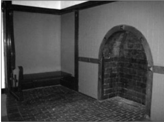
Silver Bow Club billiard hall inglenook, Butte, February 22, 2006.

and cold water and adjacent bathrooms, and well-lit hallways. The club planned to lease most of the rooms to resident members, perhaps in recognition of Butte's housing shortage, while reserving a very few for out-of-town members.